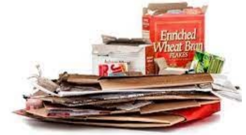
Paper, Flattened Cardboard & Paperboard